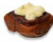
L'OCA CINNAMON BUNS