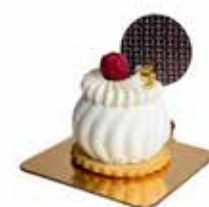
DOUBLE CREAM CHEESE CAKE