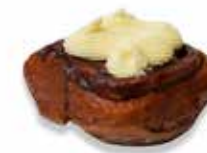
CINNAMON BUNS 4 PACK