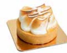
CITRUS SWIRL TART