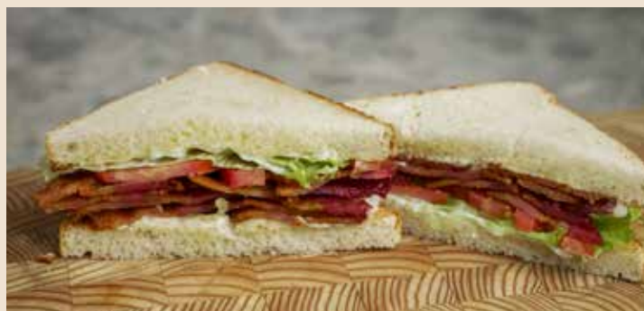
BLT ON WHITE