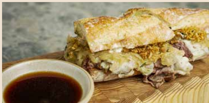
FRENCH ONION GRILLED CHEESE