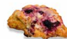
SCONES - 4 PACK