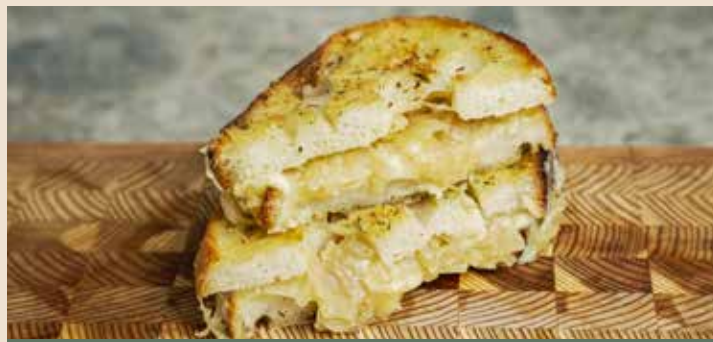
FRENCH ONION GRILLED CHEESE