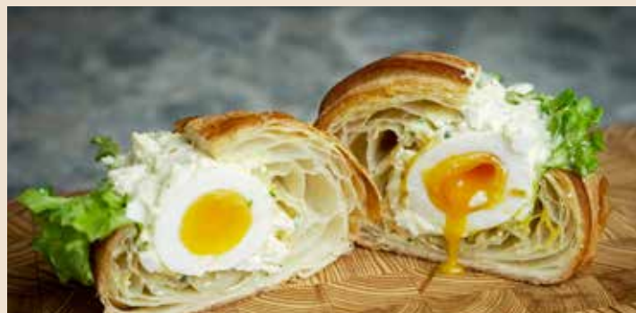
GOLDEN EGG SALAD ON WHITE