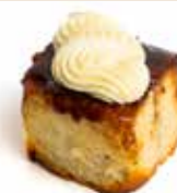
MINI CINNAMON BUNS