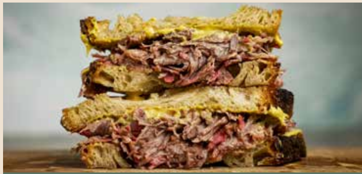
PASTRAMI ON RYE

We're taking the sandwich game to new a levels. Our meats are smoked and prepared in-house, we source the freshest veggie toppings, and our sourdough is baked just 20 feet away from the sandwich bar. Freshness you can't beat!