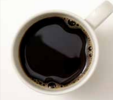
12 oz drip coffee only