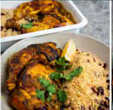
CHICKEN TAGINE with Cranberry Couscous