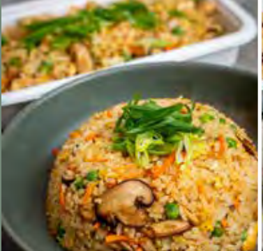
CHICKEN FRIED RICE $12.89

We've got your next meal covered with our L'OCA Chef Made Entrees.