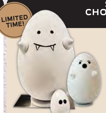
SPOOKY CHOCOLATE GHOSTS