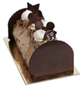
CHOCOLATE CARAMEL PRALINE YULE LOG $48.00 /EA