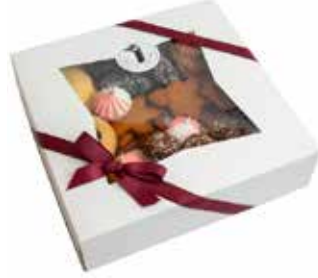
ASSORTED CHRISTMAS COOKIE BOX $40.00 /EA