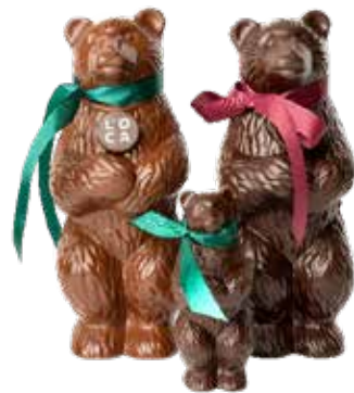
CHOCOLATE BEARS FROM $10.00 /EA