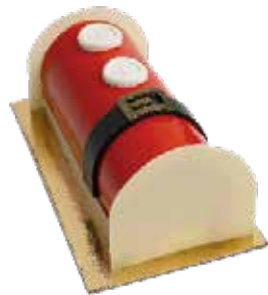
VANILLA RASPBERRY BUCHE DE NOEL $48.00 /EA