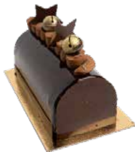
TRIPLE CHOCOLATE BUCHE DE NOEL $48.00 /EA