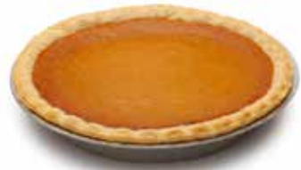
PUMPKIN PIE $18.00 /EA