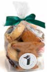
ASSORTED CHRISTMAS COOKIES $20.00 /EA