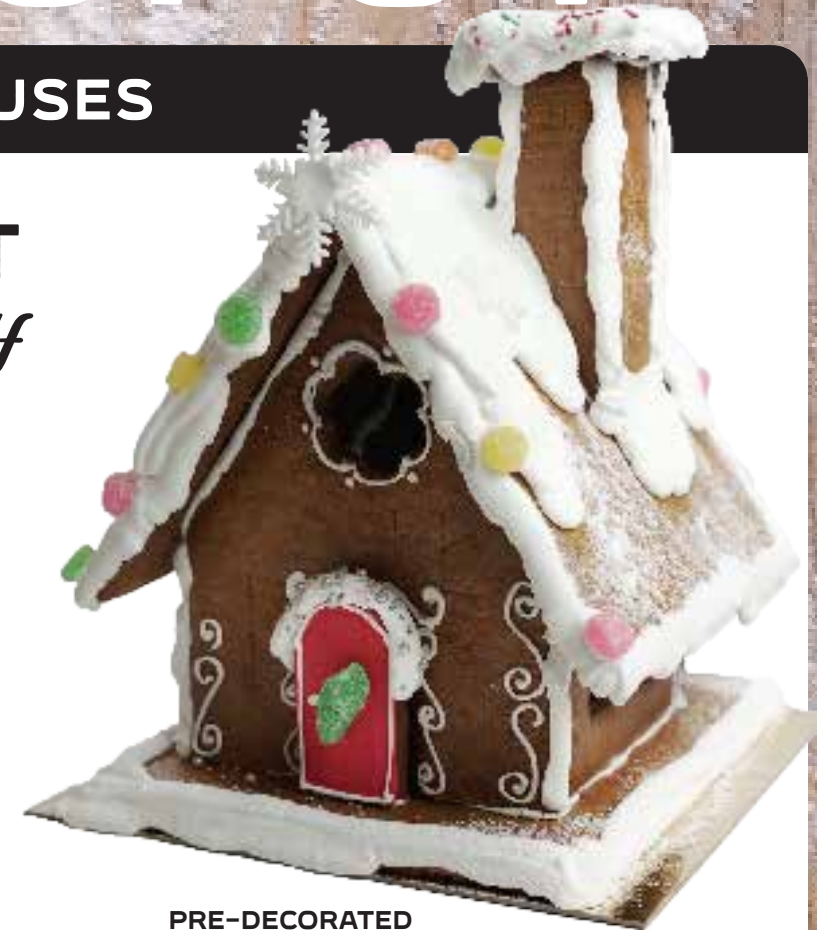
PRE-DECORATED GINGERBREAD HOUSE $95.00 /EA