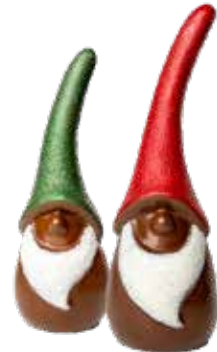
CHOCOLATE GNOMES FROM $18.50 /EA