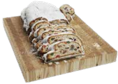
CHRISTMAS STOLLEN $35.00 /EA