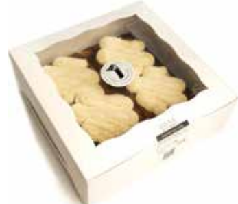
CINNAMON BUNS (4 PK) $16.00 /PK