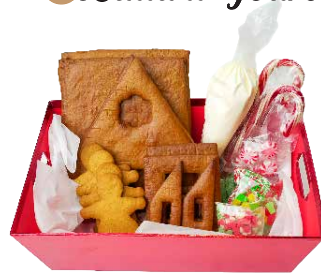
GINGERBREAD HOUSE KIT $50.00 /EA