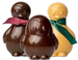
CHOCOLATE PENGUINS FROM $3.50 /EA